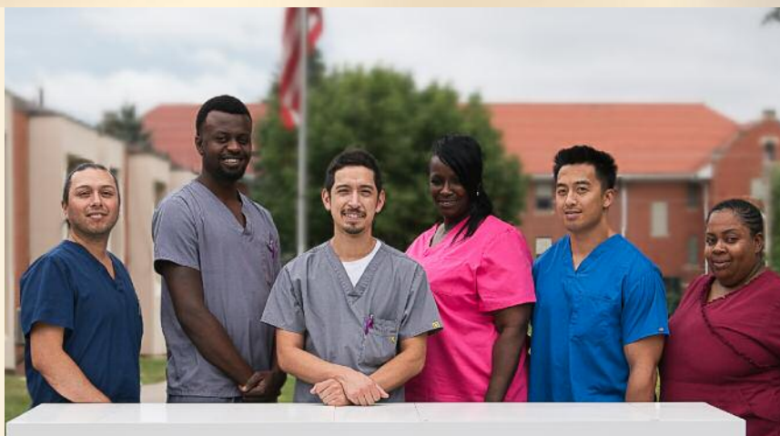
Like all ABHM communities, Maple Crest Health Center's Benson Hall nursing team strives to provide superior care to all of its residents.